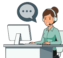
Notarius Customer Support